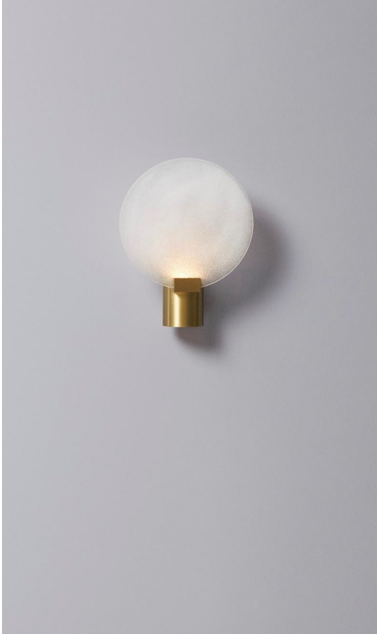
Numbus wall bronze or satin brass with handmade glass $1,515.00