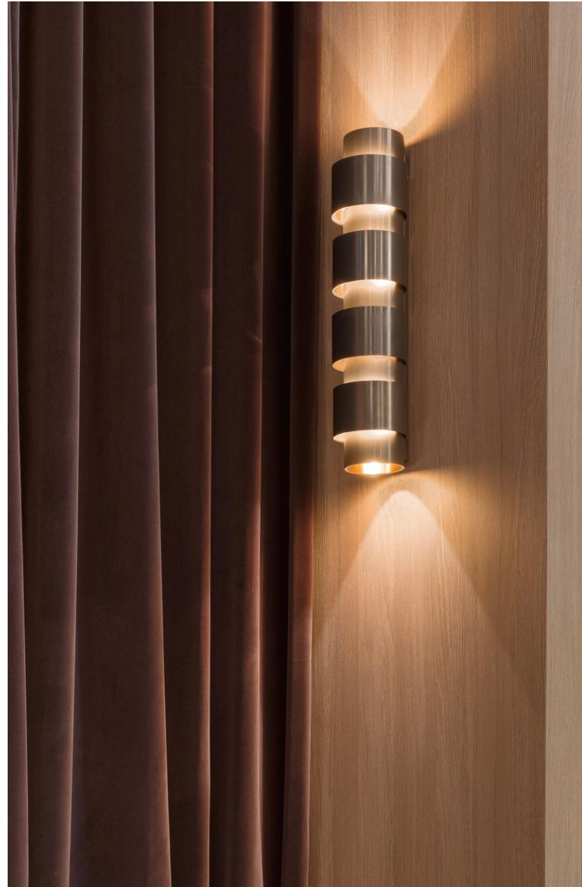
Ring wall large bronze, satin brass or Nickel $2,195.00