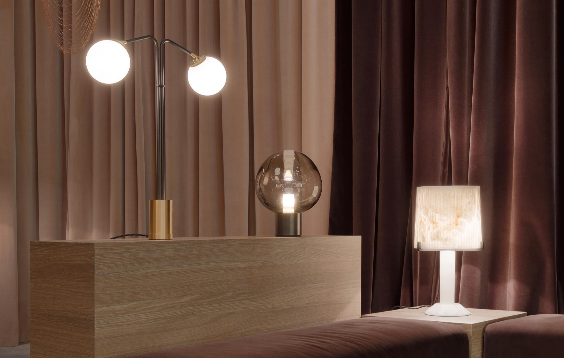
Array twin Bronze w/ Satin Brass / Satin Nickel or Polished Nickel $2,500.00