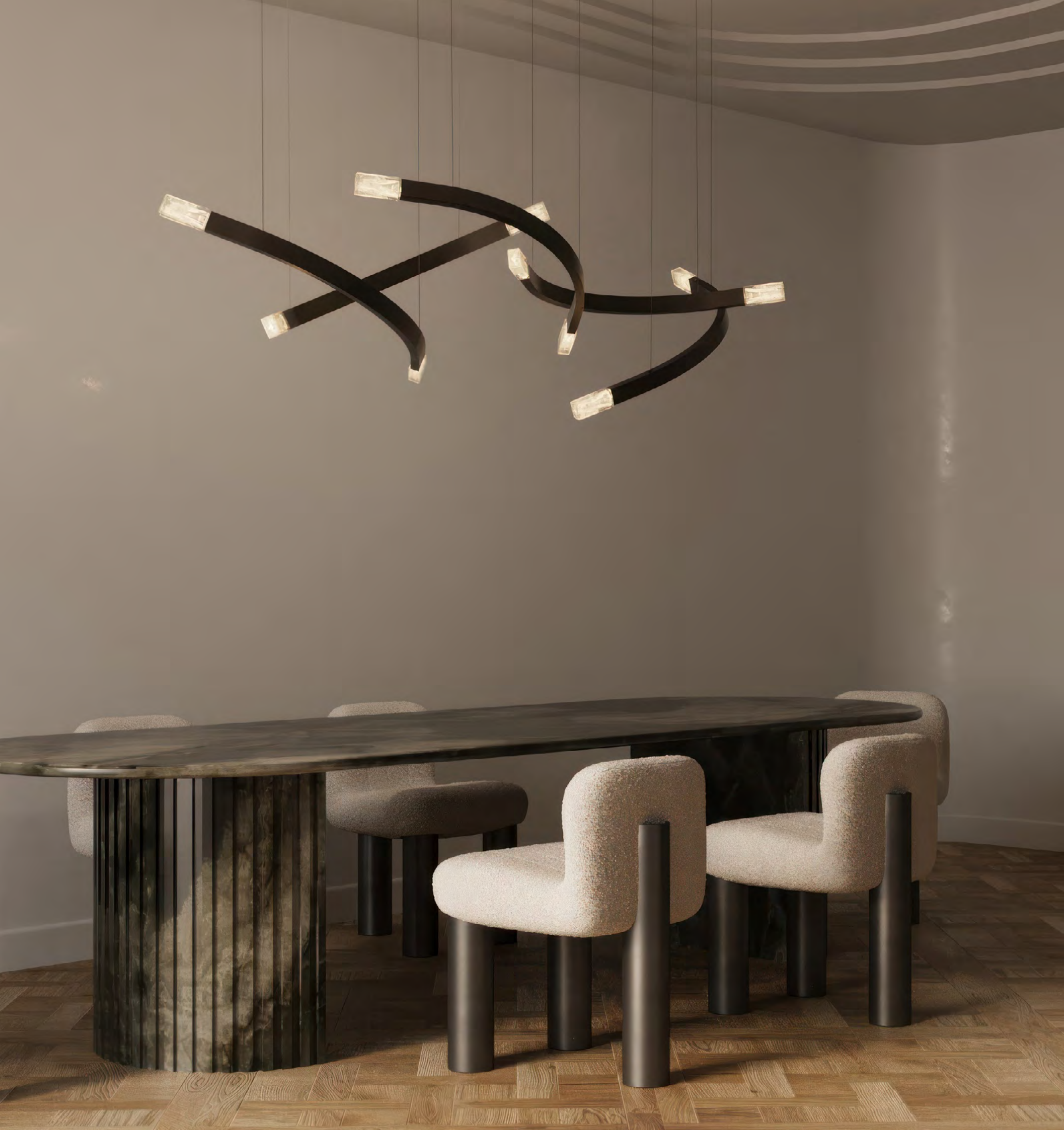
CERES PENDANT | ANTIQUE BRONZE

Inspired by the legendary island, from where mystical stories of light and shadows have enchanted the world for centuries, AVALON showcases cascades of light emanating from a precious ring of alabaster. Encapsulated in a brass or bronze framework, the natural stone creates an exquisite, ethereal illumination. Now available in a new oval shape – for even more versatility and a dramatic centrepiece.